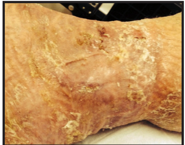
Epithelialization over hypergranulation