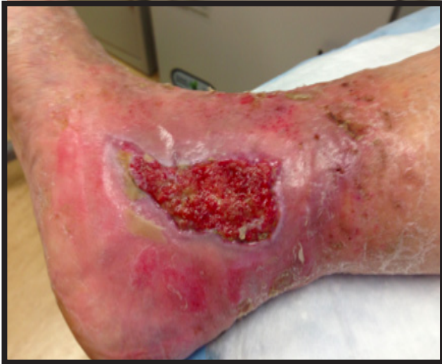
Day 0 - Initiation of CDO Measurement: 6.7 x 5.3 with hypergranulation