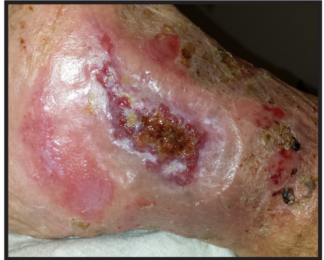
Day 29 of CDO