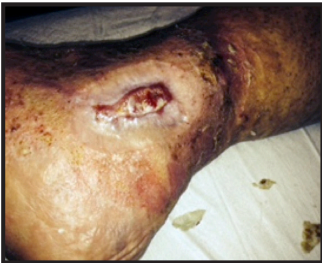
Day 54 of CDO Measurement: 3.6 x 1.3 with hypergranulation