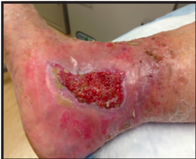
Measurement: 6.7 x 5.3 with hypergranulation