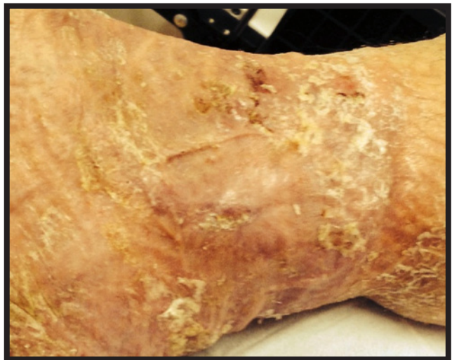
Day 79 of CDO - Wound Closed Epithelialization over hypergranulation

Published in Podiatry Today November 2014